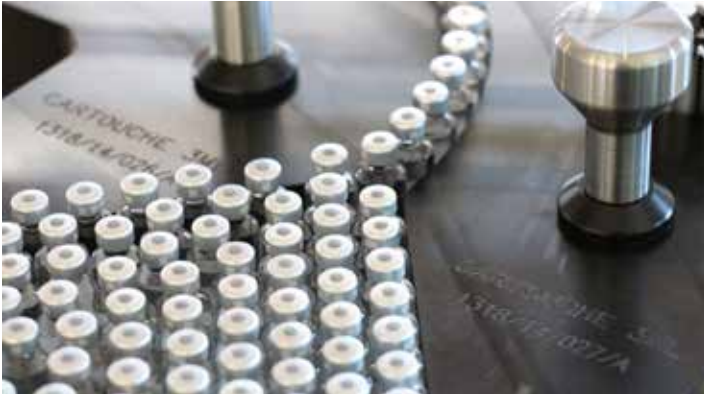
Unique ID laser engraving machine