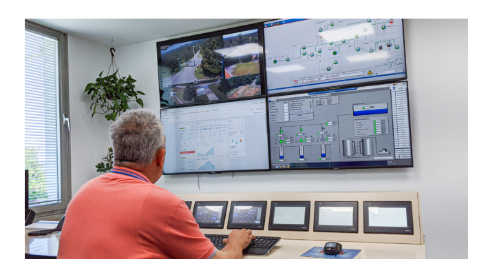
The control systems for the individual facilities are linked to each other and to a control room, which gives engineers a complete overview and allows for fast reactions.