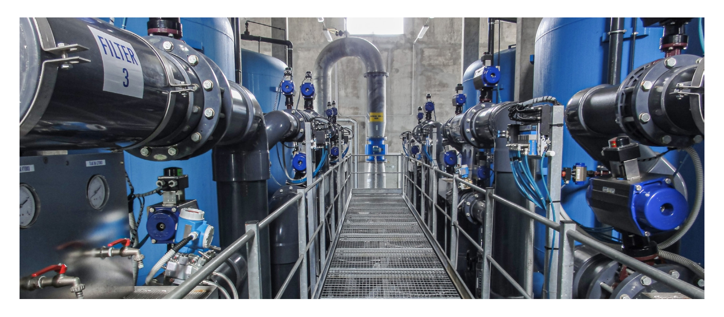
zenon is used for aggregation and analyzing of data as well as water supply control.