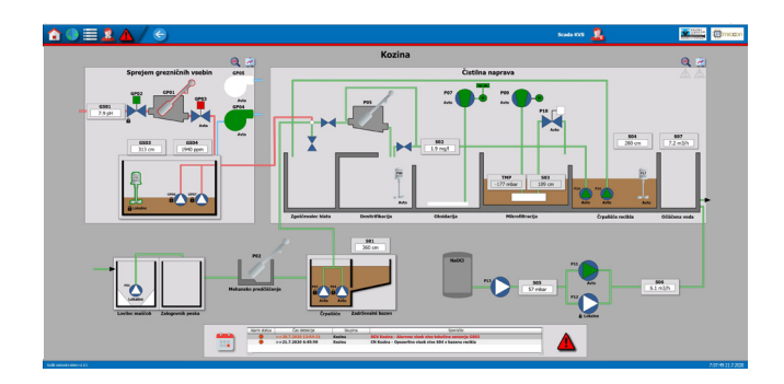
Overview of the waste water treatment facility.

overview of the status of and changes in the water supply system. One of the special features of the graphical display, as implemented at Kraški vodovod Sežana, is the discharge and filling rate indicator of the water reservoir. The indicator is connected to the alert system, which enables fast fault detection and rapid response to suboptimal conditions. Even at 20 percent, the perceptible differences between pumped and metered water in the water supply system are extremely small. "The main purpose of using the SCADA system is to detect the fault in the first place," says Borut Hočevar. Another zenon feature that contributes to this is the capability for fast communication between service personnel and operators via notes related to an individual facility.