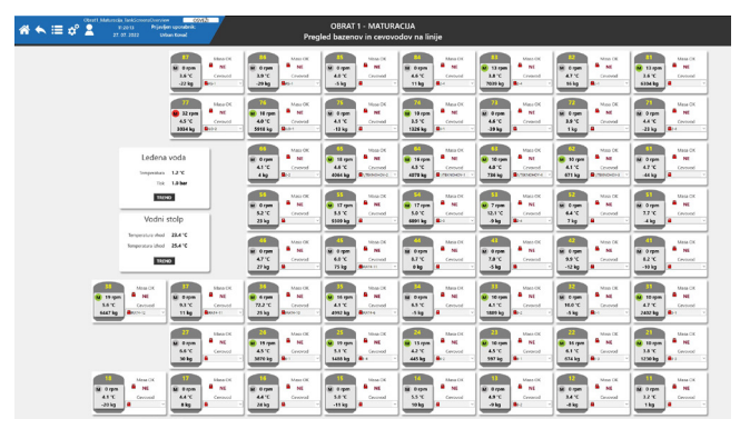
Overview of the dairy aging tanks where the mixed ice cream is stored.

EXOR ETI as a partner and its support has enabled faster progress, says the Incom Leone team.