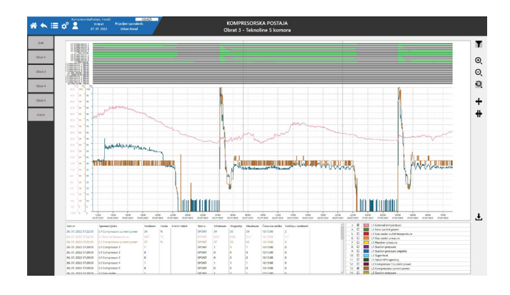
Trend of the main parameters monitored on R744 refrigeration compressors.