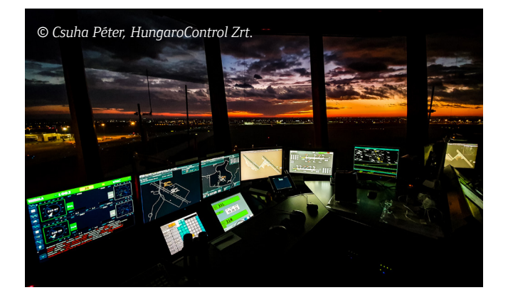
The tasks of airports include guiding airplane movements both in the air and on the ground.