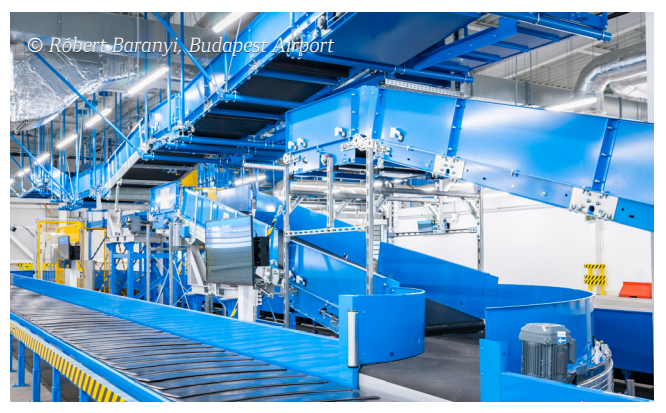
The baggage handling system at Budapest Liszt Ferenc Airport (BUD) has more than 1,000 conveyors.