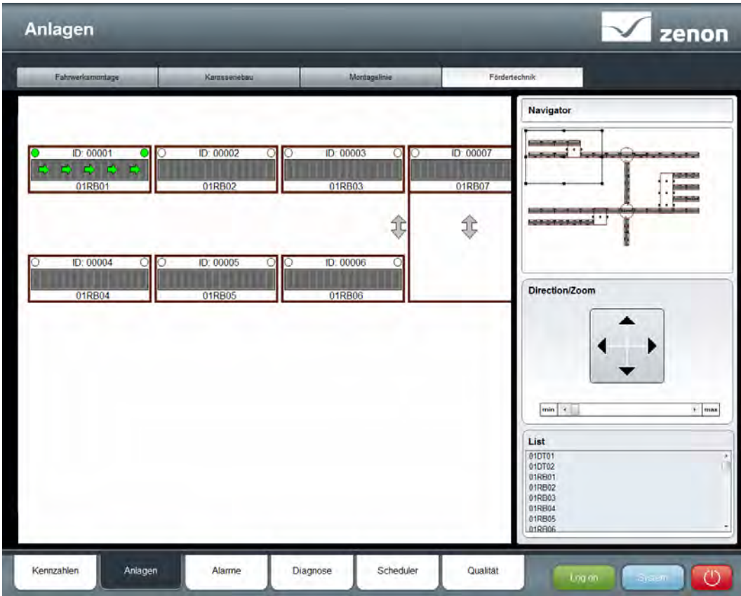
World Screen view without zooming for the detailed view

An alternative approach to the display of conveyor technology layouts is the use of the zenon World Screen. A zenon World Screen view avoids size limitations resulting from the selected screen resolution. It can be created in any desired size and also maintain the size ratio of the actual transport systems: long, narrow systems can thus be displayed in long, narrow screens. An additional system screen, the "World Screen Overview Screen", can be used to display multiple zenon World Screens and navigate through them. The displayed content of the layout screen is directly influenced by the overview screen. This control screen provides the user with elements to move the layout screen or to enlarge or reduce the size of the content. Individual elements can be activated or deactivated on the display to increase clarity.