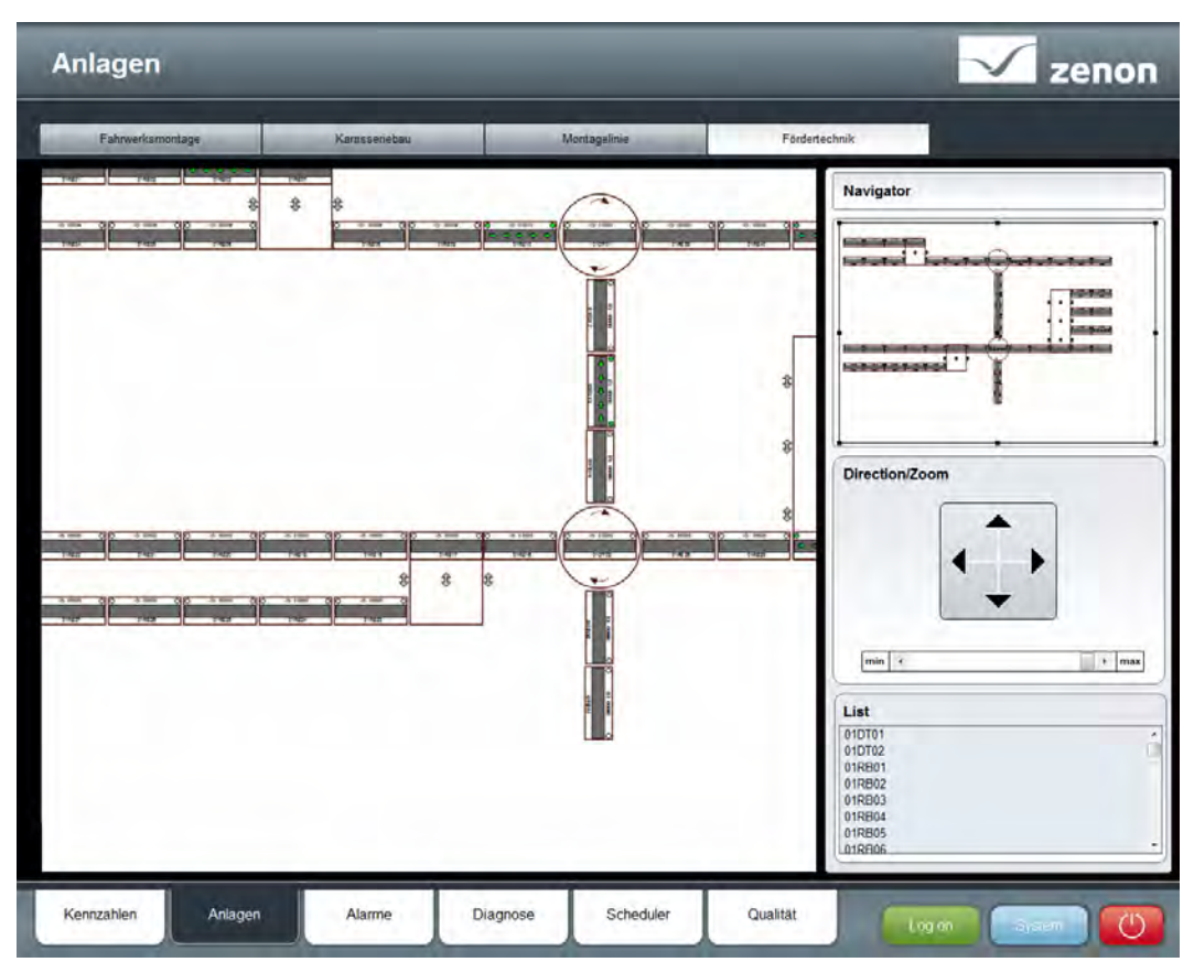
zenon World View Screen zoomed to give an overview of the entire layout

The World View Overview Screen automatically creates a list of the conveyor system elements from their name in the layout screen. The user can use this to directly select individual screen elements. Regardless of what is currently being displayed, when an element is selected the user can jump, directly to it.