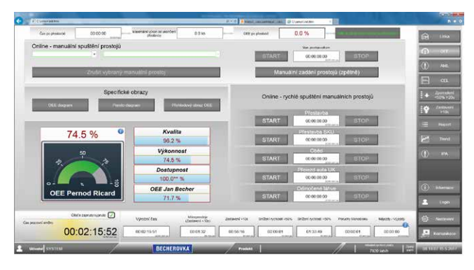
An up-to-date OEE overview is always available on the panel, which is access-protected via a RFID login, and online via web clients - without manual data collection.

zenon offers a comprehensive overview of the entire system. This facilitates troubleshooting in the event of a fault and the evaluation of the system effectiveness.