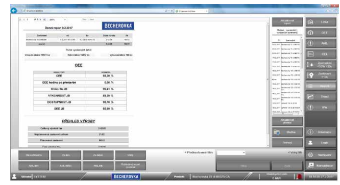
All evaluations are also incorporated into an automated reporting process

its well-functioning subsystems, the solution needed to be implemented without interfering with their PLC programming.