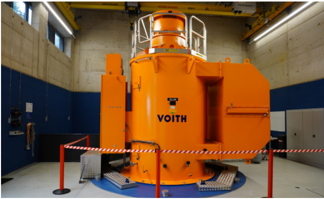
The Rotgülden hydroelectric power plant in the south of Salzburg was the first power plant that Salzburg AG equipped with a process control system based on zenon Energy Edition.